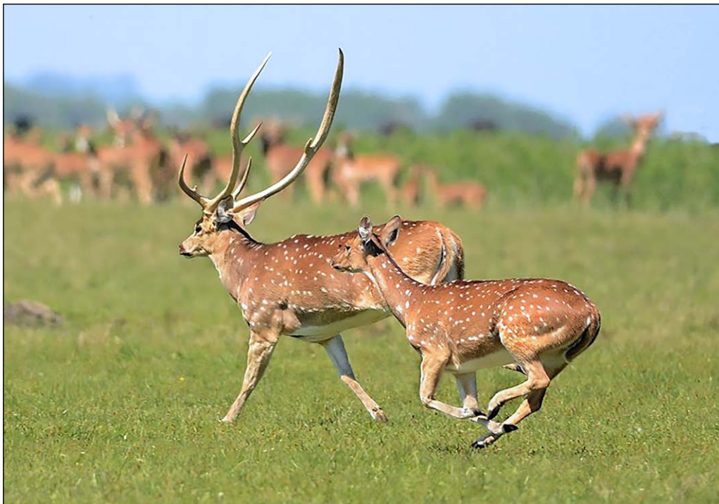
Figure 1. Axis axis in Argentina.