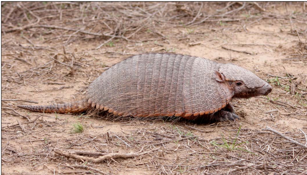
Figure 1. Chaetophractus villosus .

Armadillos are native and typical components of Neotropical faunas associated with temperate climates, historically grouped into the family Dasypodidae. According to a proposal based on mitochondrial DNA, this family should only include long-nosed armadillos or multitas ( Dasypus ), while the other armadillo species would be part of the family Chlamyphoridae (Gibb et al. , 2016), including the large hairy armadillo or peludo ( Chaetophractus villosus ; Fig. 1). This case brings up a classic, but enriching disagreement between genetic versus morphological evidence, both of which have contributed to develop scientific knowledge about phylogenetic relationships of many species.