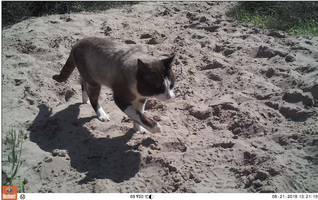
Figure 1. Felis sylvestris catus in Reserva Natural Isla Martín García, Argentina. (Photo: Ian Barbe).